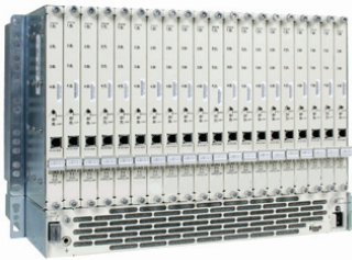
Quad 2 E1 or Quad 2 T1 in Carrier Shelf

Ditech's Bidirectional HEC solution for wireline networks is available on the following platforms: