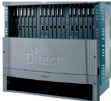
BVP Flex f100 OC-3/DS-3/STS-1/STS-1

Ditech's HEC solution for VoIP-PSTN gateways is available on the following platforms: