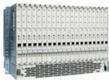
Quad 2 E1 or Quad 2 T1 in Carrier Shelf